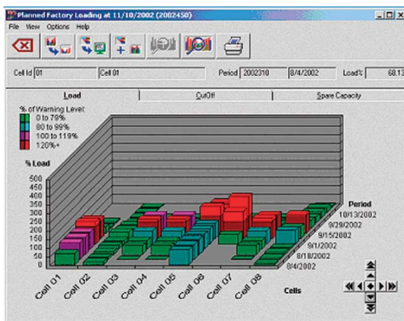
Shop Floor Capacity Planning

By creating a “live picture” of the shop floor, the APS system allows the factory manager to determine actual lead times, answer “what-if” questions instantly and feed an order into the production schedule in seconds.